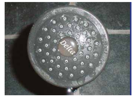
Same showerhead on 7^{th} November 2009 after wiping with hand.