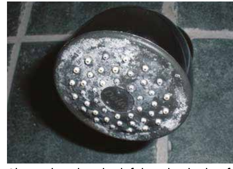
Showerhead in the left hand cubicle of the women's changing room on 1<sup>st</sup> October 2009.

The middle photo is the same showerhead on 7th November 2009, just over five weeks after installation of the Aqua-Rex unit. The original scale remains on the showerhead but no additional scale has been deposited. The difference is the quality of the scale. It is now soft and can be wiped off with the hand leaving the showerhead almost completely clean as shown in the bottom picture. The Aqua-Rex unit has softened the scale and reduced its adhesion to the shower surface. It has also stopped new scale from forming.