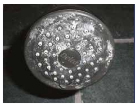
Same showerhead on 7th November 2009 before any cleaning.