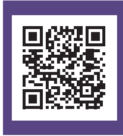
Watch this video for installation.